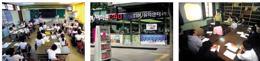
Various forms of education: public elementary school class, study abroad center, and graduate school class (from left to right)

As a result, the admission tests administered by individual colleges and universities were abolished and a new require-