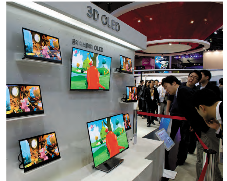
High-tech 3D OLED panels

Perhaps the most advanced and highly respected technology that humans pursued is aerospace technology, more specifically, space travel, ever since humans dreamed of flying. South Korea is no exception. In 1989, the Korean government established the Korea Aerospace Research Institute (KARI) based on the Aerospace Industry Promotion Act. The mission of KARI was to research and develop and launching of artificial satellites and space launch vehicles and operation of Space Center. Over the years, KARI has overseen the launch of ten satellites using foreign rockets and launch pads since 1992. Arirang-1 and Arirang-2 were launched in 1999 and 2006, respectively, as part of South Korea's partnership with Russia. In 2010, the first communication, ocean and meteorological satellite named Cheollian was launched from the Guiana Space Center using the French Ariane 5-ECA rocket. According to