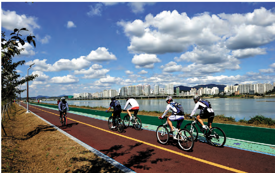
Bicycling in Han River Park Korean high-speed train, KTX