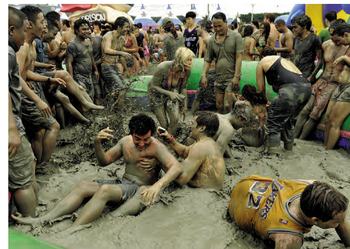
Boryeong Mud Festival

In Gangwon-do, there is the Taebaek Mountains Royal Azalea Festival organized by Taebaek City which usually takes place in late May when Royal Azaleas are at their best on the slopes of the 1,567 meter-high Taebaek mountain. It is reported that during this time some of the mountain's most picturesque locations such as the Cheonjedan altar and Janggunbong and Busoebong are strewn with the bright pink flowers. Another famous festival is the Inje Icefish Festival held at Soyangho Lake in Inje in winter from the end of January to the early February. At the festival, visitors will be able to try out ice fishing and winter ice sports such as sledding, human bowling on ice, ice soccer, and even tug-of-war on ice. As one of food festivals, the Heongseong Hanu (Korean beef) Festival is held to promote the excellent quality of Hoengseong beef. Major programs include not only tasting of delicious beef but also a world