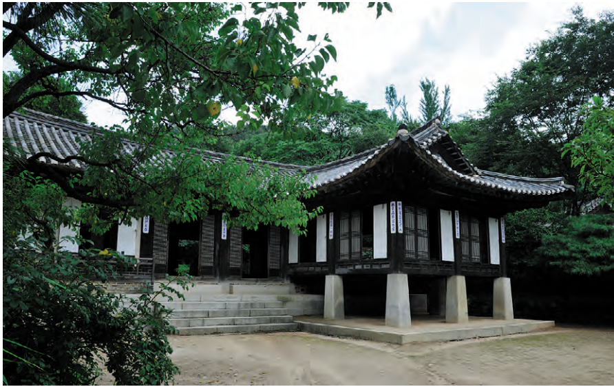
Sarangchae , men's quarter Thatch-roofed houses