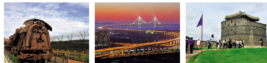
Imjingak near DMZ, the Incheon Bridge, Watchtower of the Hwaseong Fortress (from left to right)

Seoul has functioned as the capital city of South Korea