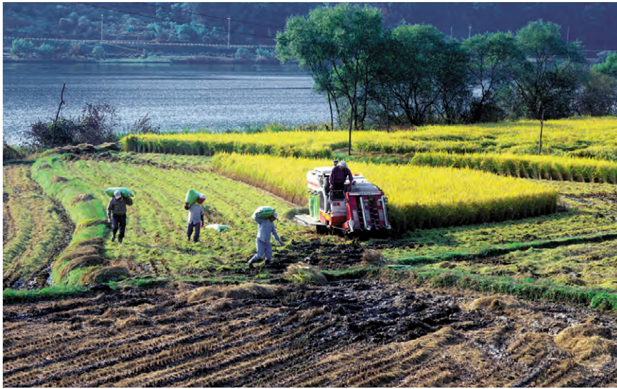
Mechanization of agriculture Modernization of rural residence