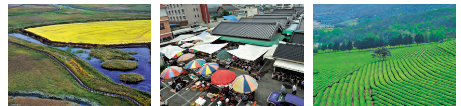
Suncheon Bay Ecological Park, Gurye 5 day market, Green tea farm (from left to right)

On the plains can be seen the sluice of an old reservoir. Built in 332, the Byeokgolje of Gimje County is the oldest among those mentioned in historical documents. The structure, having the dual function of dike and reservoir, is seen as a landscape feature that testifies to the long history of large-scale reclamation and rice farming. Unfortunately, irrigation facilities used to be hot potatoes in local political debates. Manseokbo is a good example. The dam was once a great source of disagreement between the local government, which tried to impose excessive water taxes, and the peasants, who themselves attempted to resist