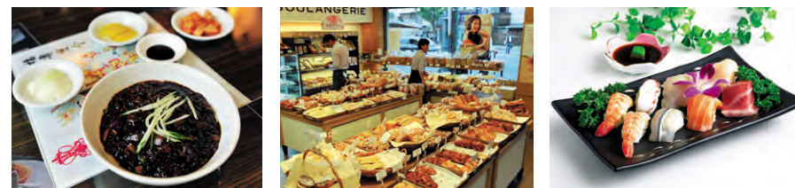
Foreign elements in Korean food: jajangmyeon , baked goods, and sushi (from left to right)