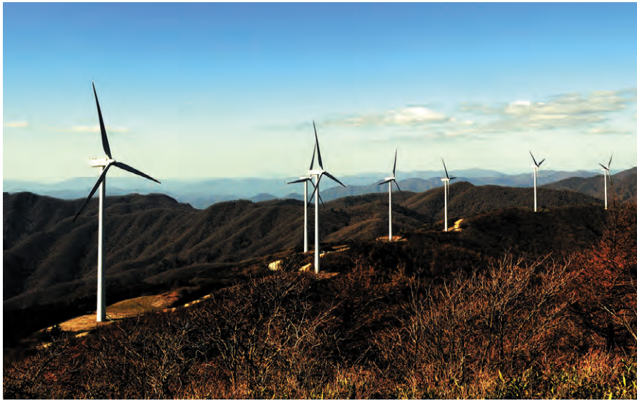
Wind-powered electric generators Solar-powered electric generators