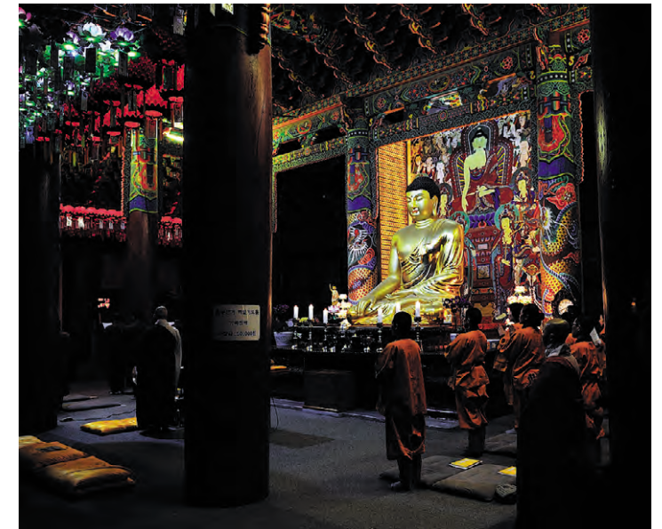
Buddhist prayer service

Christianity, a late starter, has nevertheless converted approximately 35 percent of Koreans. This conversion has happened so fast that no country in Asia can rival South Korea. The history of Korean Christianity began with Catholicism in the seventeenth century. Korean Catholicism was initiated by ambassadors of the Joseon dynasty who were sent to China. By contacting Western missionaries in China, Korean diplomats had a chance to learn about the Catholic Church. After severe persecutions by the royal class of the Joseon dynasty, Korean Catholicism began to successfully take root. The Pope visited Seoul in 1984 for the commemoration of two hundred years of