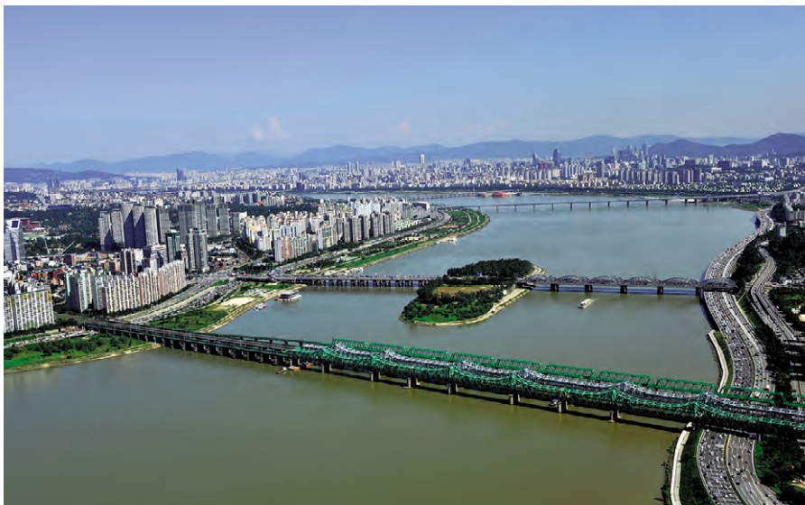
The Han River Deoksugung Palace surrounded by high rises