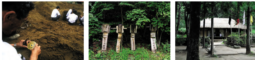
A geomancer looking for a gravesite according to pungsu , jangseung , and shaman's ritual house (from left to right)

The countryside used to have certain restricted or forbid-