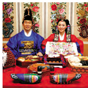
Traditional garments Court gwanbok (official attire)