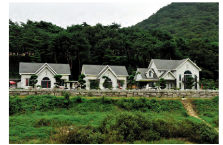
Luxury residential complexes and Western-style houses

space in the middle of the unit to recreate a madang in hanok and also feature doors with traditional patterns often found in hanok .