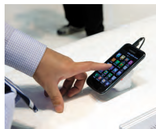
High definition LED multi-panels Semi-conductor research lab Smartphone

in taking off from the Naro Space Center. But after the successful performance of the first stage, Naro-1's payload fairing separation system malfunctioned and half of the satellite protective cover failed to open in the second stage causing the rocket to explode in flight. The second launch was made on June 10, 2010. But it also ended in failure when contact with the rocket was lost after 137.19 seconds after launch according to the Naro Space Center. Although the exact reason for the failure is yet to be revealed, the Korean space authority suspected that the cause of the failure was due to the faultiness of the separation bolts. It is announced by the Naro Space Center that the plan for the third launch has been agreed by Korean and Russian space authorities. However, no concrete date was announced.