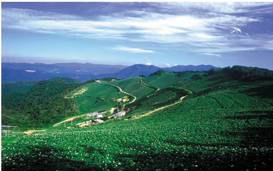
Daegwallyeong Goraengi potato farm Seollak Mountain peaks