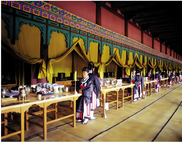
The Jongmyo Shrine

of Gyeongbok to pay tribute to the ancestral kings and queens. The shrine, as a symbolic space of Confucianism, had a simple and controlled style of architecture. The conduct, manners and procedures of the rituals were specified into a Code of Worship Rites at the Jongmyo Shrine. Historical documents advise that the number of the participants at the ritual reached more than seven hundred, including the king, queen, princes, princesses, office holders, literati, dancers, and musicians. The upper class educated under the strong Confucian tradition performed rituals in shrines that housed their ancestral tablets. This was the symbolic gesture of paying respect to their immediate ancestor who they believed took care of their more distant descendants.