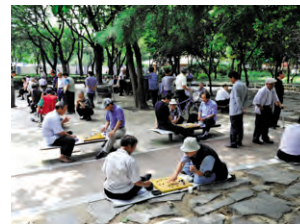
Poster for childbirth promotion policy Typical nuclear family Aging population

The other side of this change in population is the growing population of elders. It is estimated that in 2010 elders will occupy 11 percent of the South Korean population and in 2020, 15.6 percent, which means that South Korea is rapidly becoming a society of "advanced age." The government has every reason to be concerned about the prospect of becoming an aged society with lowered productivity. The increasing number of the elders leads to another problem. Most Korean elders need financial support because they are not financially independent. They also need to be cared for. Elders used to be cared for by their children according to Confucian values of filial piety. But some lower-class families cannot afford to provide sufficient care for their elders; nowadays they need appropriate support from social welfare.