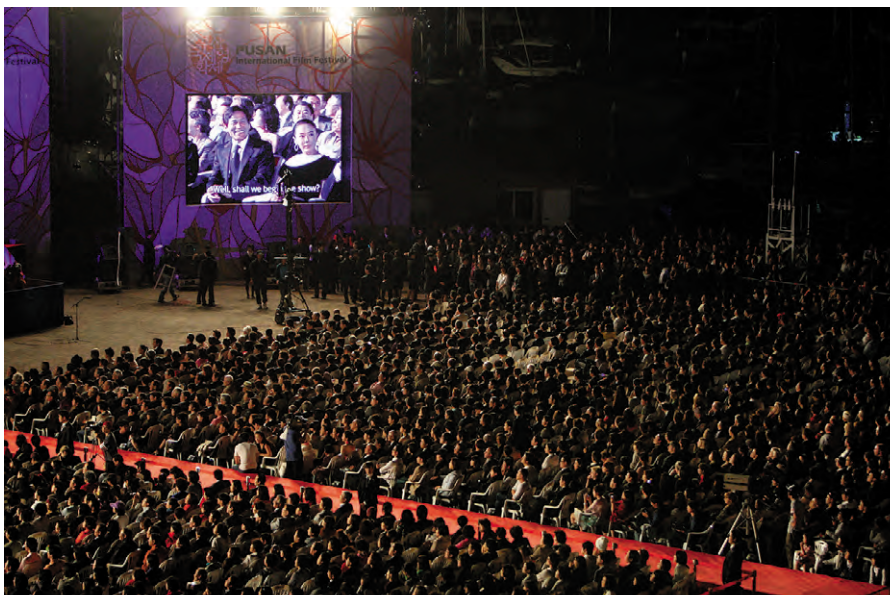
Pusan International Film Festival

decreased the screen quota from 146 days to 73 days, the days which movie theatres must show Korean films, saying that it needs to provide fair competition to the foreign films. In responses, Korean filmmakers, actors, actresses, and supporters formed the Coalition for Cultural Diversity in Moving Images and rallied public opinions to raise the quota or at least maintain the existing system because without it the Korean cultural industry will collapse under the dominance of U.S. cultural goods like Hollywood films and U.S. drama which have already occupied a major portion of movie and TV markets in Korea. According to the Korean Film Council, the market share of U.S. films increased from 36.8 percent in 2006 to 49.3 percent in 2008 whereas the number for the Korean films decreased from 59.7 percent to 40.4 percent.