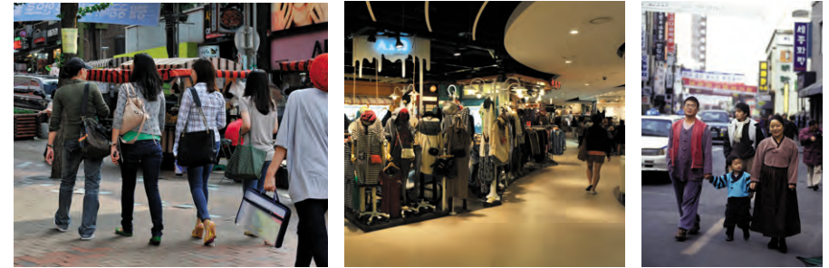
Saenghwal hanbok side by side with international urban fashion

The Western trend in clothing that started in men's uniforms spread into ordinary men's and women's clothes during the Japanese colonial period. Korean men having a higher education abroad started to wear Western suits and hats. "New Women" who received modern education were named "modern girls" since they had short hair and wore shortened traditional girl's skirts. Korean traditional clothes became the target of revision as