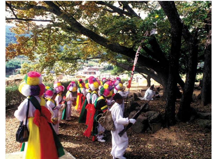
A community rite wishing for good harvest

As ancient Korea became an agricultural society, a state system was established with a central government. Since the Gojoseon period, the first effective Korean state, Korea has maintained a centralized state system, which resulted in the unusual emergence of an early single nation-state. Throughout the changes of dynasties until the last dynasty of Joseon, the