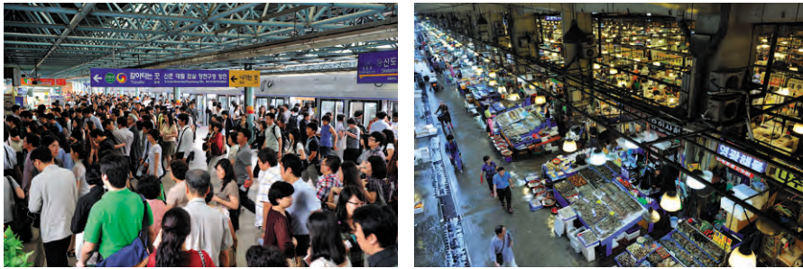
Subway station filled with commuters and traditional seafood market

saenghwal hanbok (practical traditional clothing). It was revised sufficiently to be worn comfortably in everyday life, yet boasted a traditional design and natural fabric. It became very popular by the late 1990s, but later it began to be made of silk incorporating expensive designs. Most traditional clothes have now become too expensive to wear in daily life; they are considered formal dress for special occasions. Koreans now wear them for special family events such as weddings, birthday parties, and traditional holidays. In 1995, a “ Hanbok Wearing Day ” was enacted by the government, and some civilian groups now encourage the wearing of hanbok , but their efforts have not been so successful.