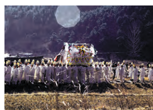
Jokbo (genealogical book) Traditional marriage ceremony Funeral procession