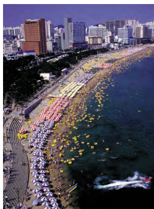
Stone Buddha Relief at Namsan Chilbulam, Gyeongju Historical Heritage Site Smelting at POSCO Haeundae beach, Busan

cavate atrium of Seokguram, the outdoor banquet hall of Poseokjeong, the Cheomseongdae observatory, the ice storehouse of Seokbinggo, the grave mound of Cheonmachong, the Dabotap pagoda, and many others.