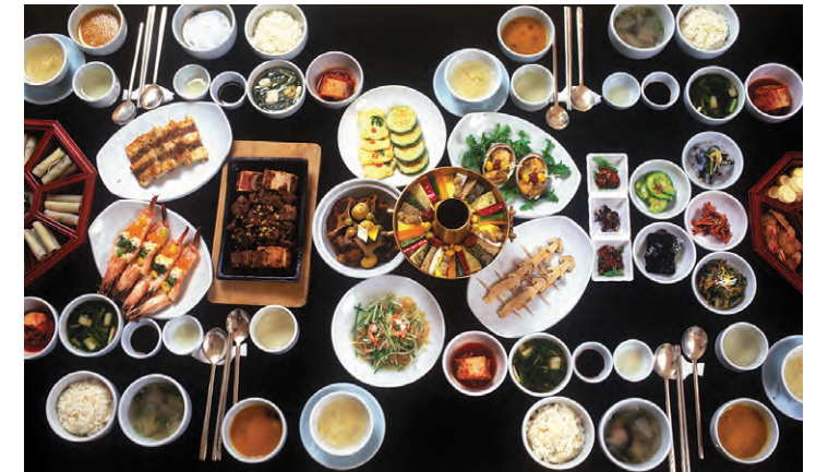
Modern version of royal table setting

Characteristically, one of the major features of Korean food has been the variety of fermented products consumed in the daily diet. Fermented foods such as soybean paste, red pepper