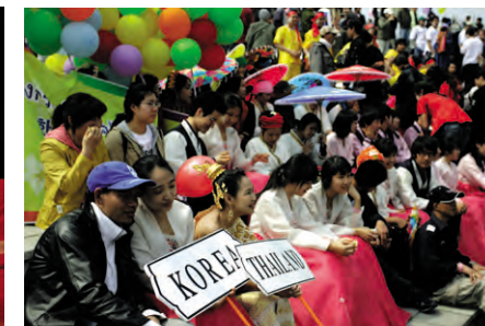
Inter-racial children, Festival of foreigners residing in South Korea

with experiences of cultural difference and diversity and continued efforts by the government and civil society to raise awareness South Korean society is surely moving forward to becoming a multicultural society.