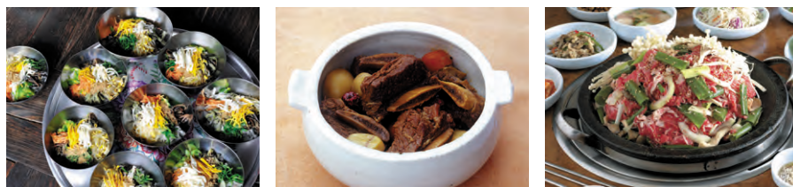
Popular Korean dishes: bibimbap , galbijjim , and bulgogi (from left to right)

However, after the 1980s, Chinese restaurants began to lose their dominant position as a popular place for eating out as other fast food restaurants and Korean haute cuisine restaurants rapidly increased. Another reason for the decline of Chinese restaurants was due to the increasing awareness on health, nutrition, and hygiene among Koreans. 4 The common knowledge that Chinese food is greasy and high in calories and the popular image of Chinese restaurants as being dirty also exerted negative influences. Partly in response to such negative influences and partly due to the increase of international exchanges of people and materials, new kinds of Chinese restaurants—some stressing authentic Chinese foods and some specializing Chinese dishes that have been local-