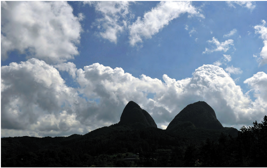
Horse Ear Mountains or Maisan Hanok village, Jeonju