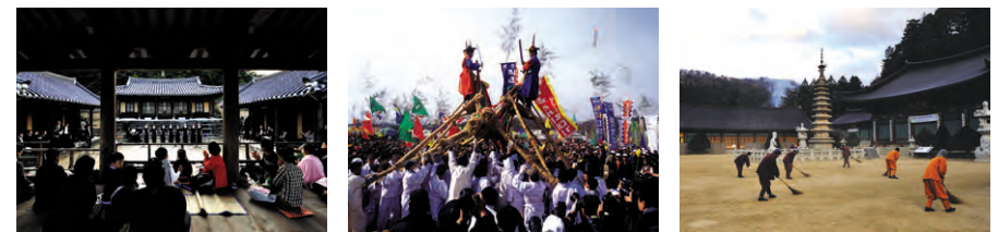
Cultural activities: concert at a seowon , gossaum folk game, and temple stay (from left to right)

It is impossible to mention all the festivals that go on within a year. However, most popular and successful festivals are worth mentioning. They are, by region, as follows. The detail