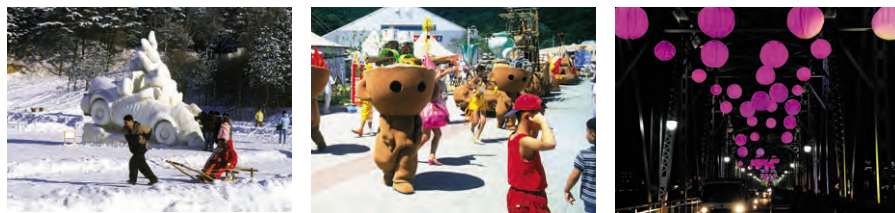
Various local festivals: snow festival, ceramic festival, and lantern festival (from left to right)

Major cities started to hold big festivals such as the Busan International Film Festival, the Gwangju Biennale Art Festival, the Daegu Milano project, the Chuncheon Mime