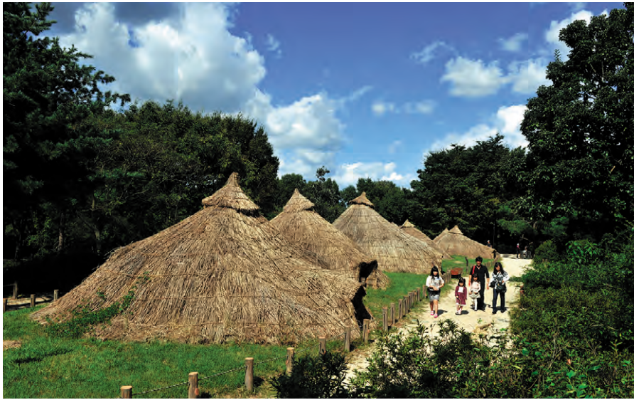
Prehistoric residential huts reproduced at Amsa-dong Prehistoric Settlement Site Myeongnyun-dang (main study hall) in typical Confucian architecture