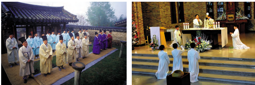
Confucian ancestor worship and Catholic service

names of major denominations. Anglican, Salvation Army, Lutheran, Church of Christ, and Quaker are also important denominations in South Korea. Through the various religious activities and active social participation such as welfare programs, they serve the lower class via medical institutions and schools, Korean Christianity grows constantly. Believers participate in services regularly every weekend and on certain weekdays. Active and frequent meetings of congregations such as early morning prayer meetings held every day at sunrise are often identified as one of the factors for the rapid growth of Korean Protestant Christianity.