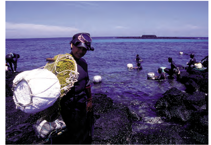
Jeju haenyeo at work

Until very recently, the livelihood of Jeju people was based on dry farming and fishing. Rice paddies are so few here that their role in the regional economy is meager. The fishing