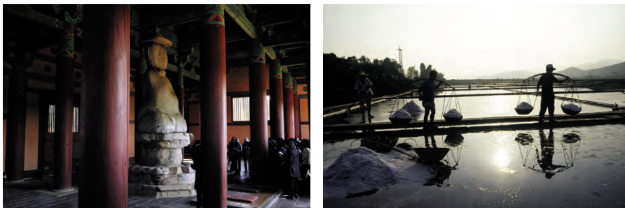
Stone statue of Buddha at Jeongnipsa Temple, Buyeo, Salt farm (from left to right)

the local people, they are indispensable grounds where they capture fish, shrimp, clams, and crabs for a living. These days, many tidal flats are being enclosed by dikes and reclaimed into paddies and produce a huge amount of rice.