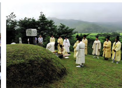
Women preparing sacrificial food and meals at a jesa , Patrilineal kin group at an ancestral rite at a grave (from left to right)

er compounds of various kinsmen who constituted the jageunjip (the small houses).