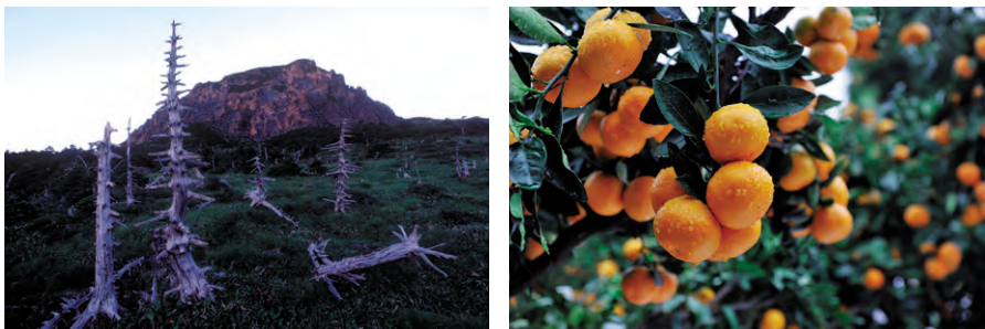
Mount Halla, Jeju oranges called gamgyul (from left to right)

(Jungmun Tourist Complex) Jeju-do became Korea's favorite honeymoon destination. It is estimated that after 2005 more than five million tourists visit Jeju-do each year. In 2010 the number of visitors to Jeju-do reached five million just in the first half of the year raising expectations that the goal of reaching 10 million is just around the corner.