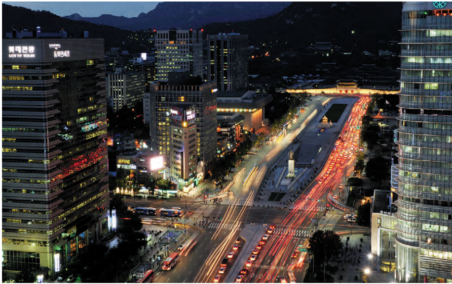
Global city Seoul that never sleeps One of many shipyards that made Korea world's top shipbuilder