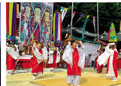
Korean Buddhism in modern Korean society

Silla, and Goryeo, Buddhism as a guiding ideology sustained Korean politics, economy, and other aspects of social life.