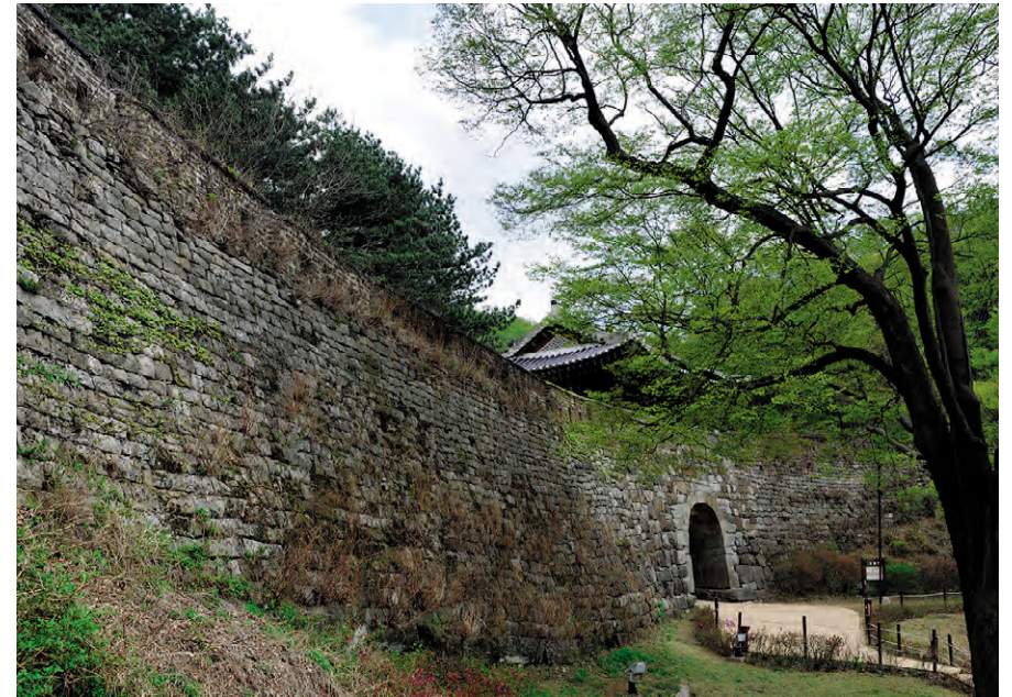
Namhan Mountain Fortress wall and gate

At this moment, the Gyeonggi region is in the middle of